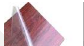
Surface Protection Films